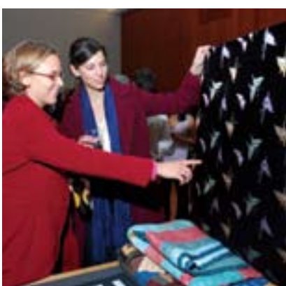
Potential bidders at the student auction.