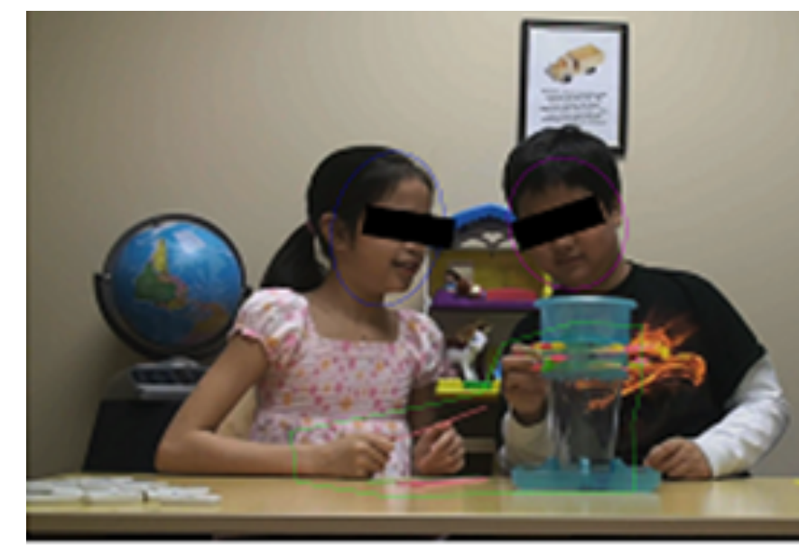
Figure 2. ET paradigm in which actors do not speak during a shared activity.