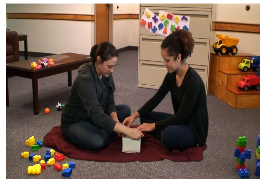
Figure 1. ET paradigm in which actors speak during a shared activity.